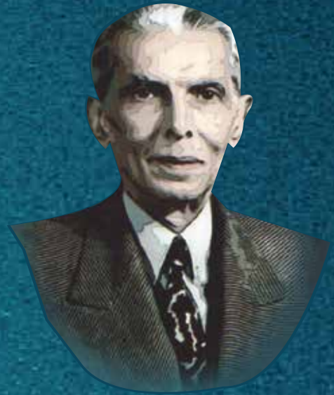
Quaid-e-Azam Muhammad Ali Jinnah

” Without education it is complete darkness and with education it is light. Education is a matter of life and death to our nation. The world is moving so fast that if you do not educate yourselves you will be not only completely left behind, but will be finished up. The Holy Prophet(PBUH) had enjoined his followers to go even to China in the pursuit of knowledge. If that was the commandment in those days when communications were difficult, then, truly, Muslims as the true followers of the glorious heritage of Islam, should surely utilize all available opportunities. No sacrifice of time or personal comfort should be regarded too great for the advancement of the cause of education.