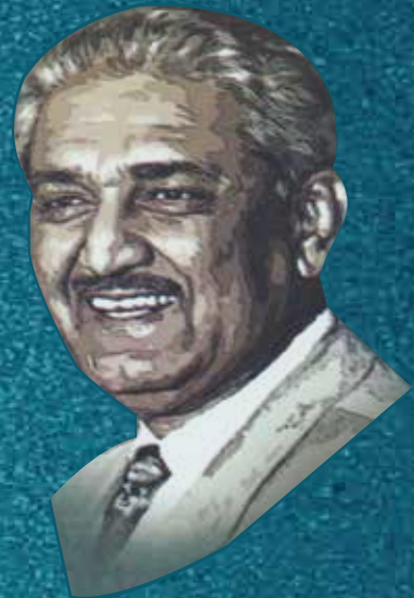
Dr. Abdul Qadeer Khan

Hatred intolerance poor hygienic conditions and violence all have roots in illiteracy, So we are trying to do some thing to help the poor and the needy.